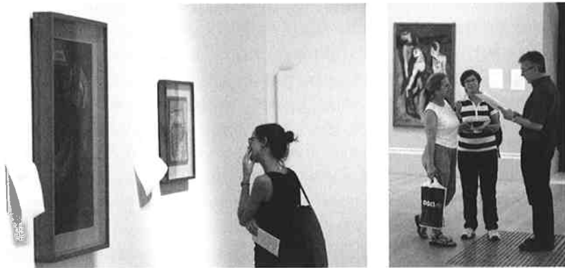
TANIA BRUGUERA is a Cuban artist who divides her time between Havana and Chicago. Her interdisciplinary work focuses on the relationship between art, politics and life. Since 2002 she has been working on a series of projects in which she appropriates structures of power, creating political situations rather than just representing them. Here, BRUGUERA instructed the curators to 'fly post' the Tate Britain galleries with pages from the directive on the return policy for illegal immigrants ( P6_TA-PROV(2008)0293 – the title of the intervention), approved by the European parliament just a few days before the Prologue. In the manner of a protest, the pages covered the rooms and obscured interpretation panels. The intervention was 'activated' by a gallery attendant, employed by BRUGUERA , who read out loud passages from the directive whenever visitors asked questions, whether relevant to the intervention or not. By obstructing the usual appearance and function of the gallery and humorously blurring intended participation with the confusion of those taken by surprise, the artist encouraged the audience to engage with issues of migration and exile. BRUGUERA was invited to participate in Exiles but was unable to obtain a visa to enter the UK. Her absence, though unfortunate, resonated with the themes of the day.

Still, one could argue that these dangers are more the results of the institutionalisation of the nomadic as an art world and mainstream cultural fashion rather than the unavoidable outcomes of artistic practices, and moreover that the nomadic nevertheless retains its radical potential when it comes to the critique of identity and belonging in a period marked by the troubling reassertion of nationalism, ethnicity, and religious fundamentalism. Perhaps the nomadic holds within itself a similar resistance to traditionalism as that one encounters in the expatriate avant-garde, the critical necessity of which has once again gained ground. In this regard, the shifts of emphases in the cultural expressions of exile over the course of modernity – from anti-nationalist exile, to postcolonial diaspora, to global nomadism – are not so clear cut, nor is their periodisation punctual or definitive. It is not surprising that Edward Said and Homi Bhabha, for instance, return to Theodor Adorno and Walter Benjamin in their discussions of the cultural and political effects of displacement; similarly Kobena Mercer, in his own theorisation of dialogism, revisits the Russian formalist Mikhail